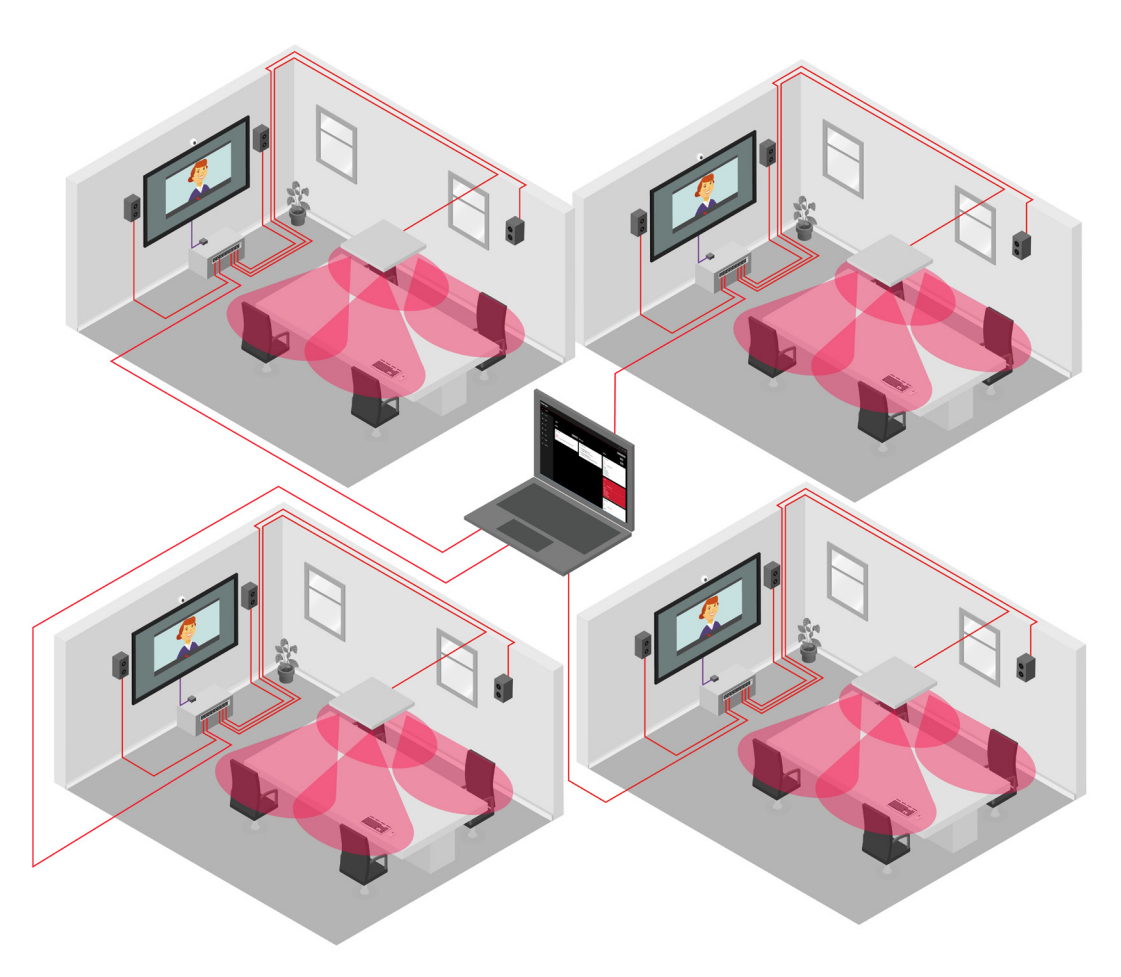
Figure 3: Multiple socially-distanced conference rooms managed by a single Dante Domain Manager