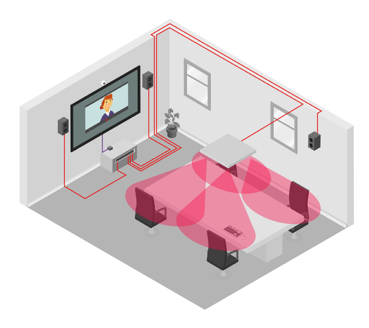
Figure 2: : Audio-over-IP solution with ceiling microphone and multiple loudspeakers for complete coverage

Audio-over-IP solutions like Audinate's popular Dante are widely available in products from hundreds of manufacturers, providing a toolset that ensures a consistent, intuitive workflow with 100 percent interoperability between devices. Even used in a simple implementation, Dante addresses most of the concerns we have for safe, socially-distanced conferencing and is extendable to address many more.