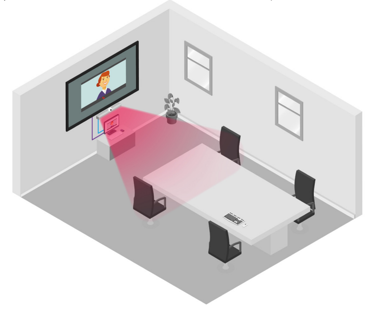
Figure 1: Soundbar solution with limited coverage in a socially-distanced conference room

Still, the fact remains that too many conferencing solutions are simply not well adapted to a socially distanced workplace. AV equipment intended for use in small gatherings often consists of a small dedicated PC, a USB-connected soundbar with a built-in mic, and perhaps a webcam. Users are forced to unsafely huddle around one end of a table in order to hear what is being said, and to be heard on the other end of the call. Sometimes users substitute their own laptops for the room PC, adding BYOD (Bring Your Own Device) headaches to the situation.